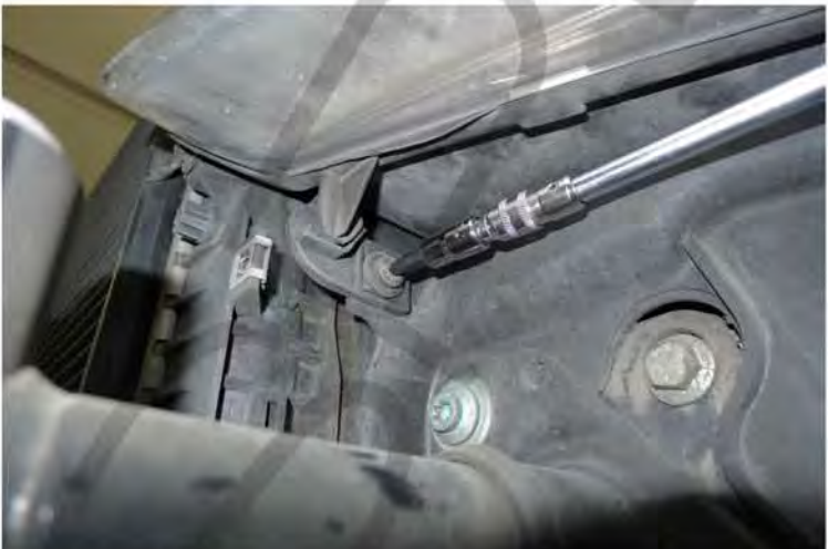
9. Remove the T30 bolt