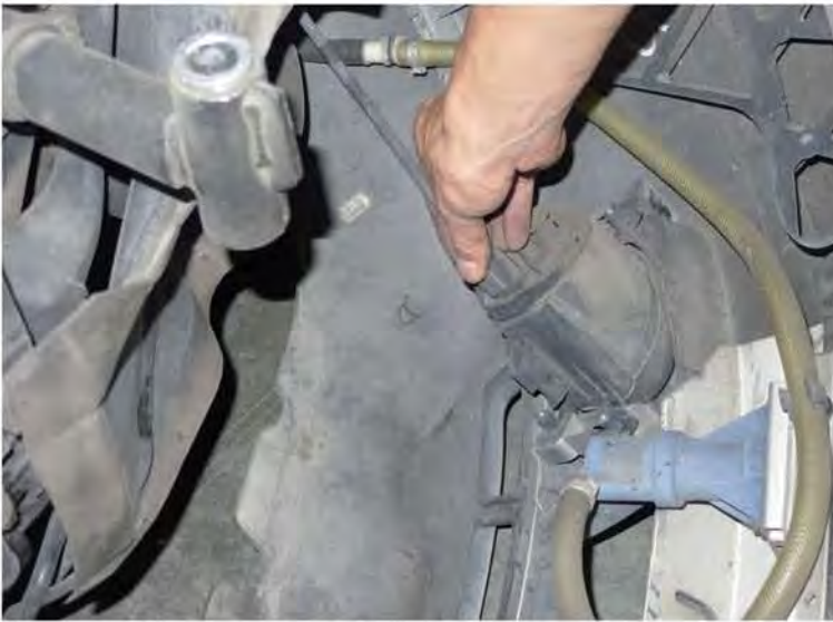
5. Disconnect the fog light harness