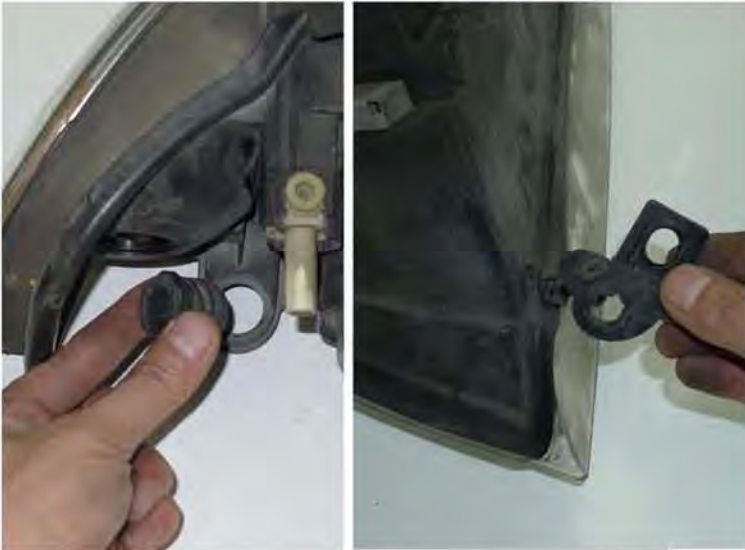
13. Transfer the plastic nut onto the new headlight Transfer the plastic bracket onto the new headlight