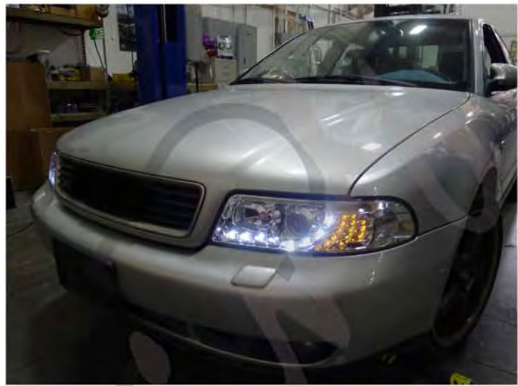
24. Please repeat the steps in order from 1 to 23 for the opposite side