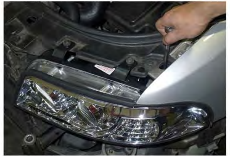
16. Tighten the (3) T30 bolts