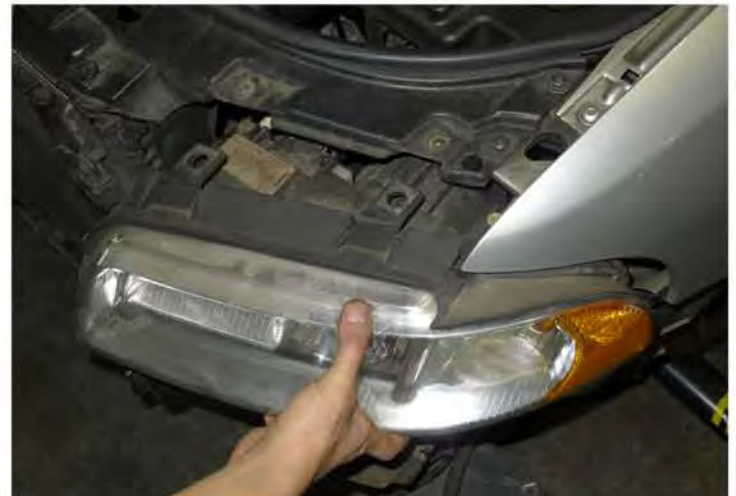
10. Remove the headlight