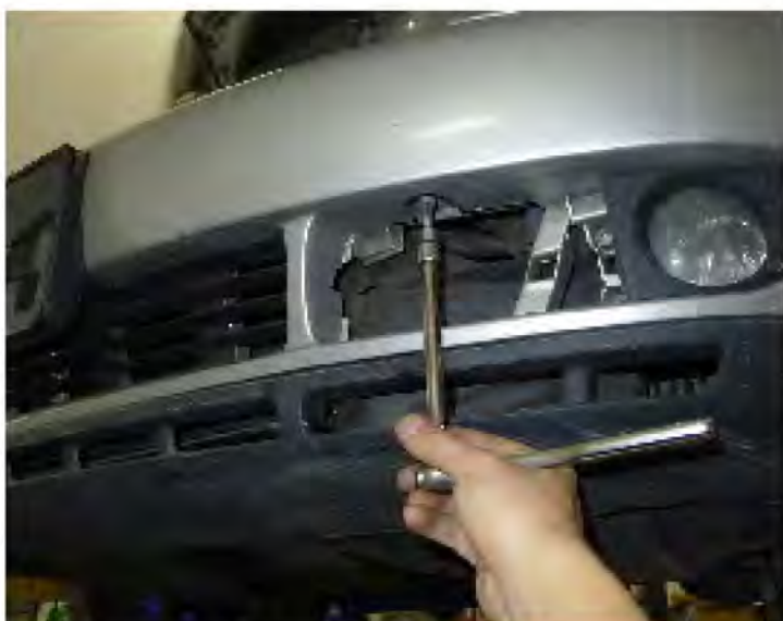
3. Remove the 6mm allen bolt