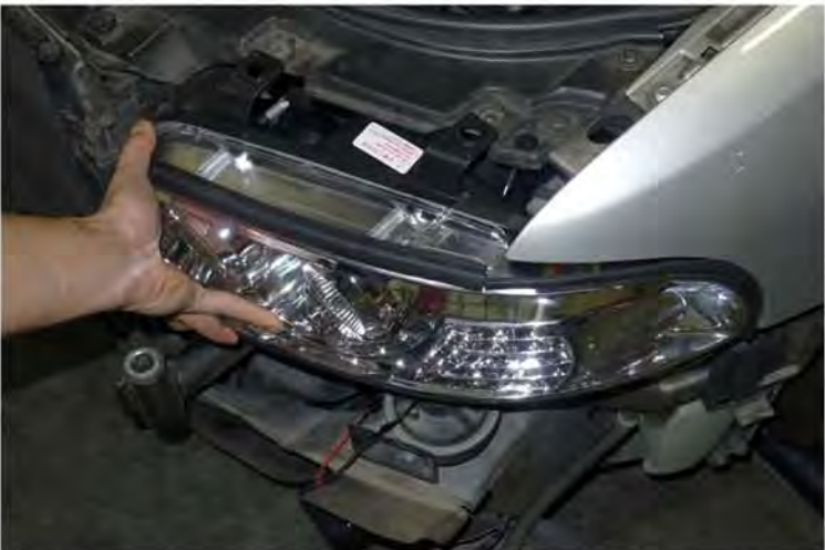
15. Place the new headlight to the stock location