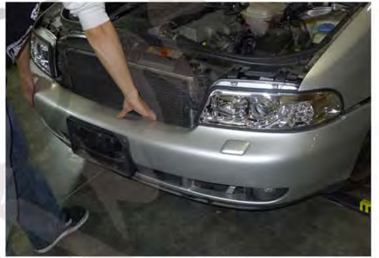
20. Replace the front bumper