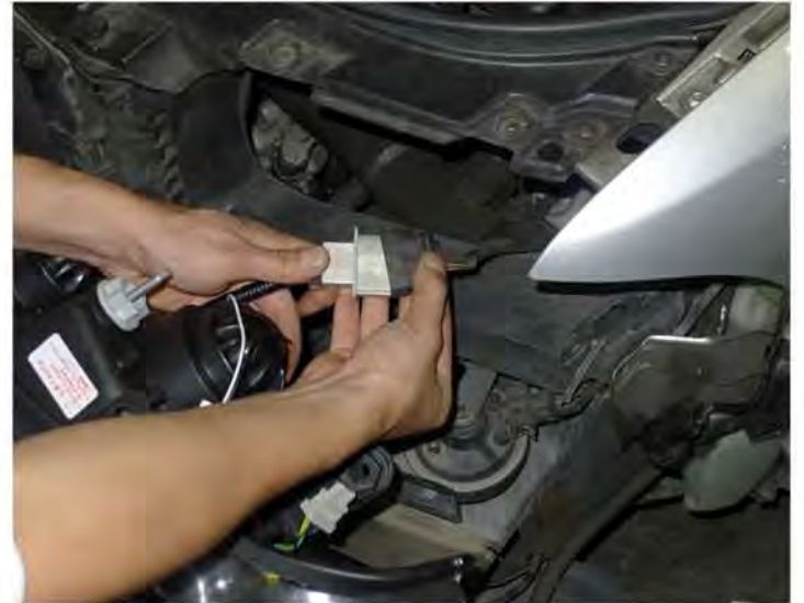
14. Connect the headlight harness to the new headlight Please see the Halo and L.E.D installation instruction If your headlights don't have HALO or L.E.D. You can skip it