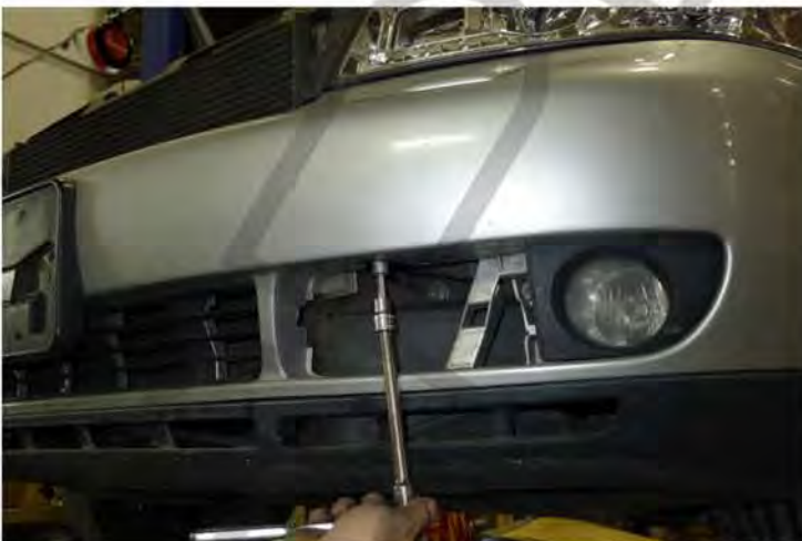
21. Replace the 6mm allen bolt