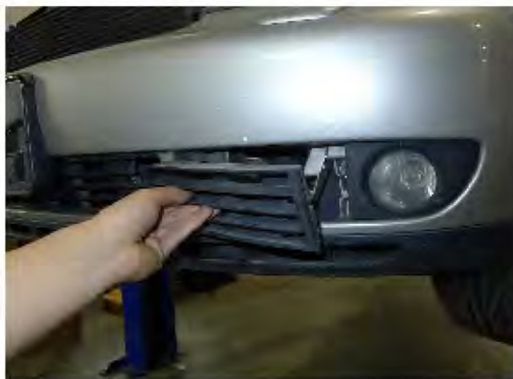
2. Remove the lower grill