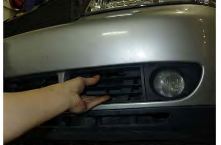
22. Replace the lower grill