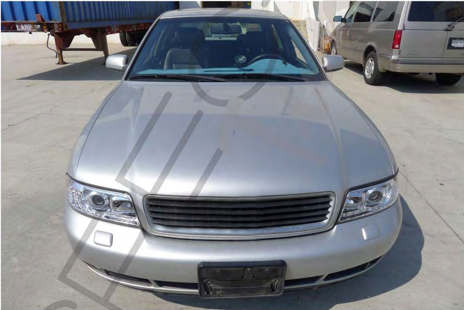
25. The installation is now complete