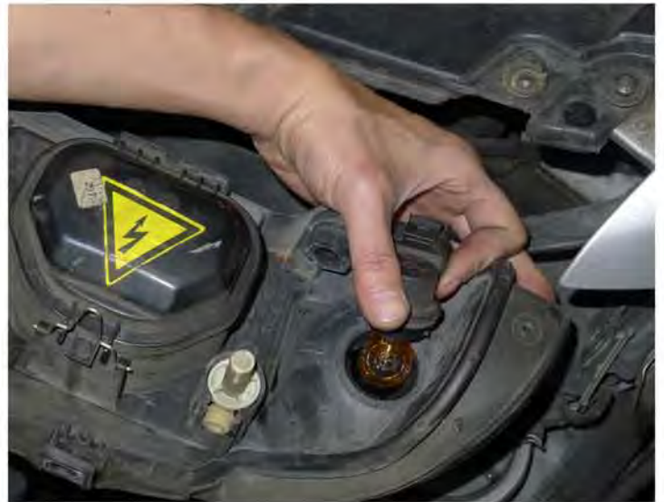
12. Remove the signal light socket