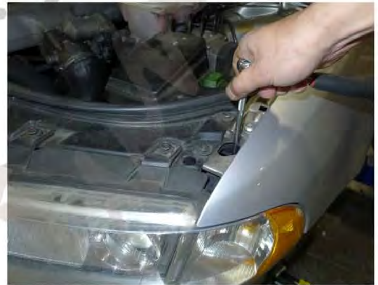
8. Remove the (3) T30 bolts