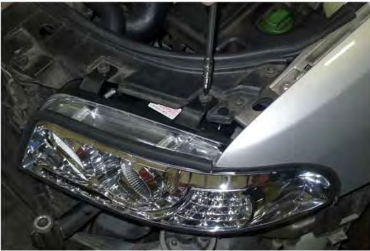
17. Tighten the (3) T30 bolts