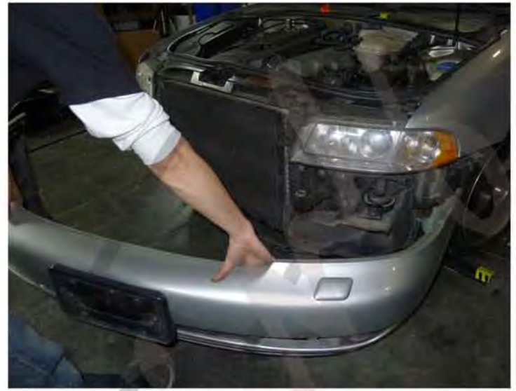
6. Move the front bumper to the one side