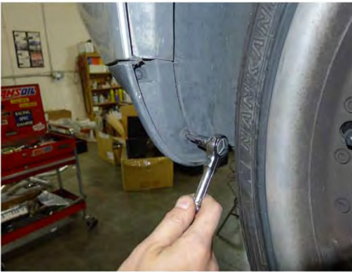
23. Tighten the T25 screw