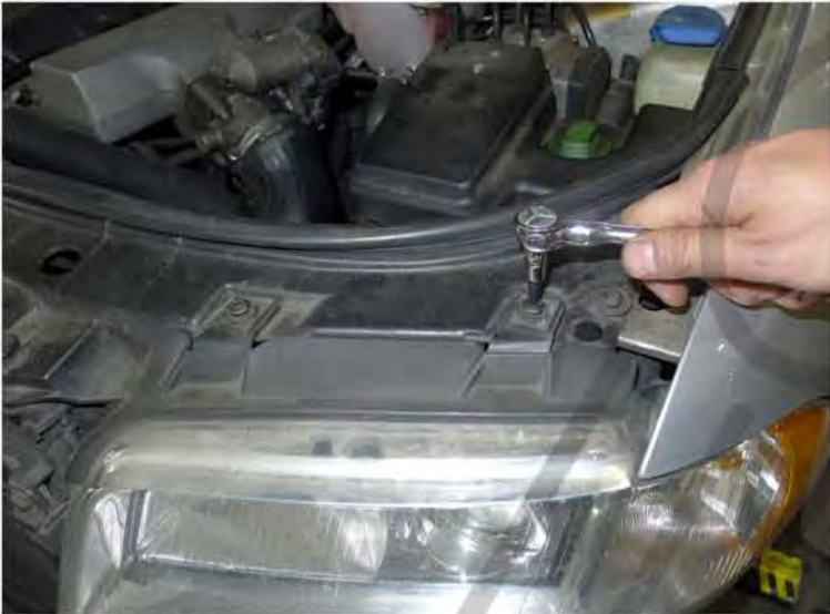
7. Remove the (3) T 30 bolts