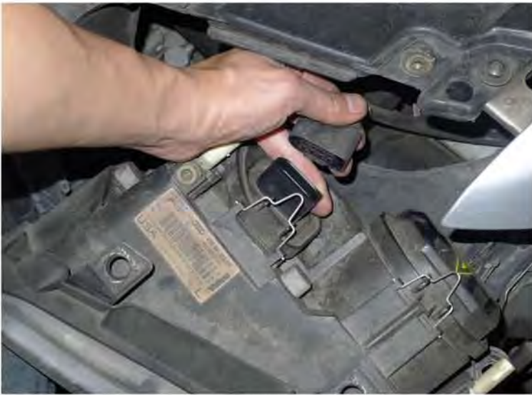
11. Disconnect the headlight harness