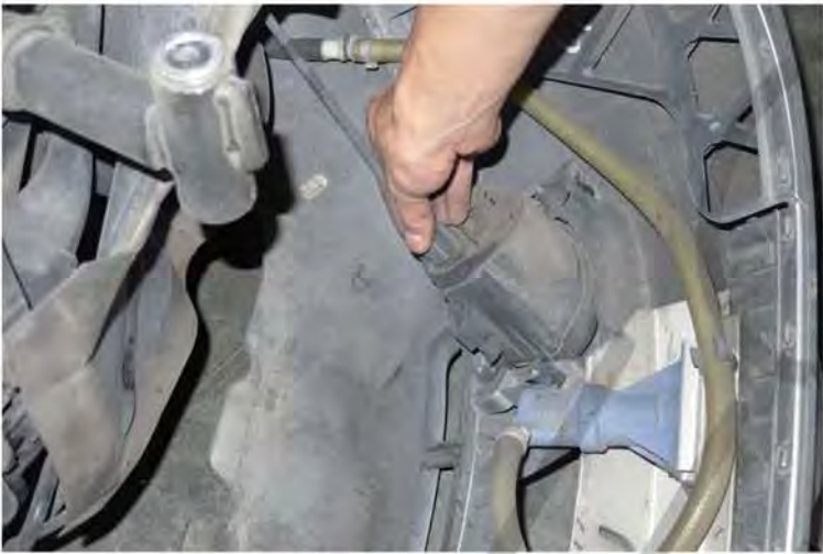
19. Disconnect the light socket