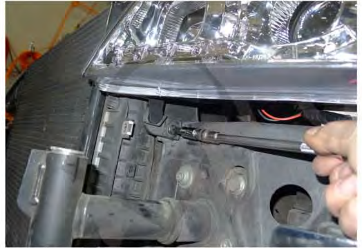
18. Tighten the T30 bolt